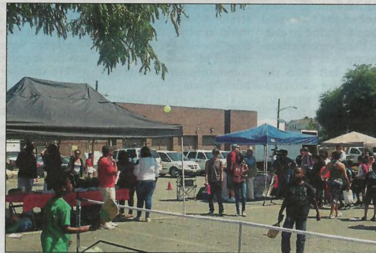
Trenton youth play pickleball, a tennis-style paddle sport, during the Trenton Public Schools Back to School Academic Extravaganza at the city Board of Education's building and grounds Friday.

City youth displayed their intellectual prowess Friday when they composed nature-themed haiku poems at the event. "Water preserves life. Water makes the soul rejoice. Life, water, happiness,"